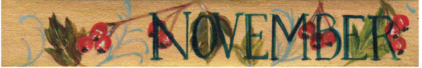
illustration - Amanda Brookes